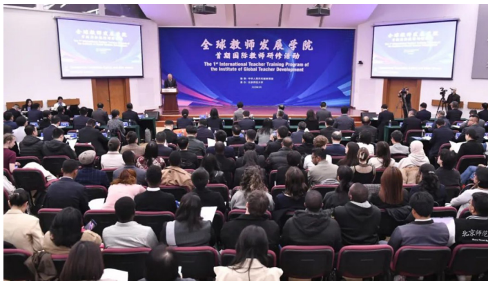
The first international teacher training program in session.

The Institute of Global Teacher Development, initiated by China's Ministry of Education, was officially established in Beijing on March 27. About 200 representatives, including teachers and students from more than 50 countries, took part in the first international teacher training program.