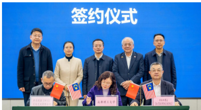
Representatives of the College of International Education of Chengdu University of Technology and the Federation of Chinese Associations Malaysia and Zhongguang Tongyuan (Sichuan) Cultural Exchange Co Ltd sign an agreement.