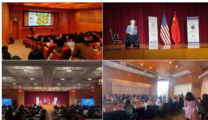
The National Chinese Language Education Conference in session.

The 2025 National Chinese Language Education Conference was held at the Chinese Embassy in Washington on March 22. The conference, with the theme "Embracing the future: The application of artificial intelligence in teaching", was organized by the Chinese Language Association of Secondary Elementary Schools. Participants discussed the role of AI tools in language courses and new strategies for advancing Chinese language education in the United States. More than 150 Chinese-language teachers, education administrators and experts from about 20 US states attended.