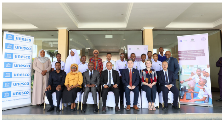
Representatives of the interested parties.

The UNESCO-BNU Project on Closing the Digital Divide: Ensuring Gender-Transformative Digital Skills Education for Women and Girls was launched by the Ministry of Education, Science and Technology in Dodoma, Tanzania, on 14 March 2025. The UNESCO-BNU Project, organized by UNESCO and Beijing Normal University, aims to bridge the gender gap in STEM education and career opportunities, empower young women to be key contributors to the digital economy, and promote gender equity in technology.