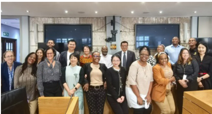
Representatives of both sides

The Confucius Institute of Traditional Chinese Medicine at the University of the Western Cape was jointly established by the University of the Western Cape, Zhejiang Normal University and Zhejiang Chinese Medical University in September 2019.