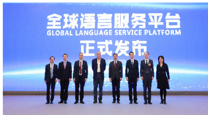
Invited guests helping launch the Global Language Service Platform.