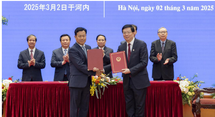
Representatives of Tsinghua University and Hanoi National University at a signing ceremony.