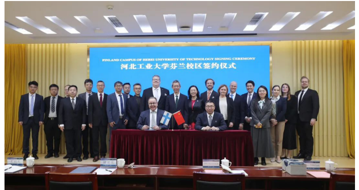
Representatives of both universities after the signing ceremony.