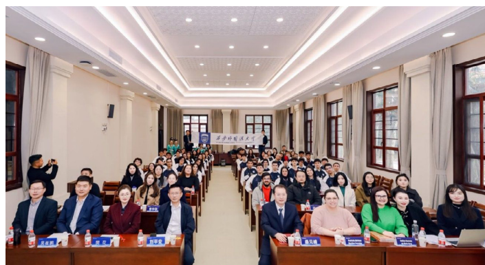
Xi'an International Studies University and Paraíba State Education Program inauguration in session.

Xi'an International Studies University and Paraíba State Education Program was inaugurated at the Chinese Culture Experience Center on the Chinese university's Yanta campus on March 17. This program is the first strategic collaboration project between XISU and the Paraíba State Department of Education in Brazil, representing a milestone in China-Brazil educational collaboration. Under this initiative, Paraíba State will send about 50 students to XISU each year for a three-month Chinese-language and cultural immersion program over the next five years.