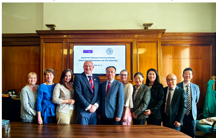
Representatives of Jilin University and the University of Manchester after signing cooperation agreements.