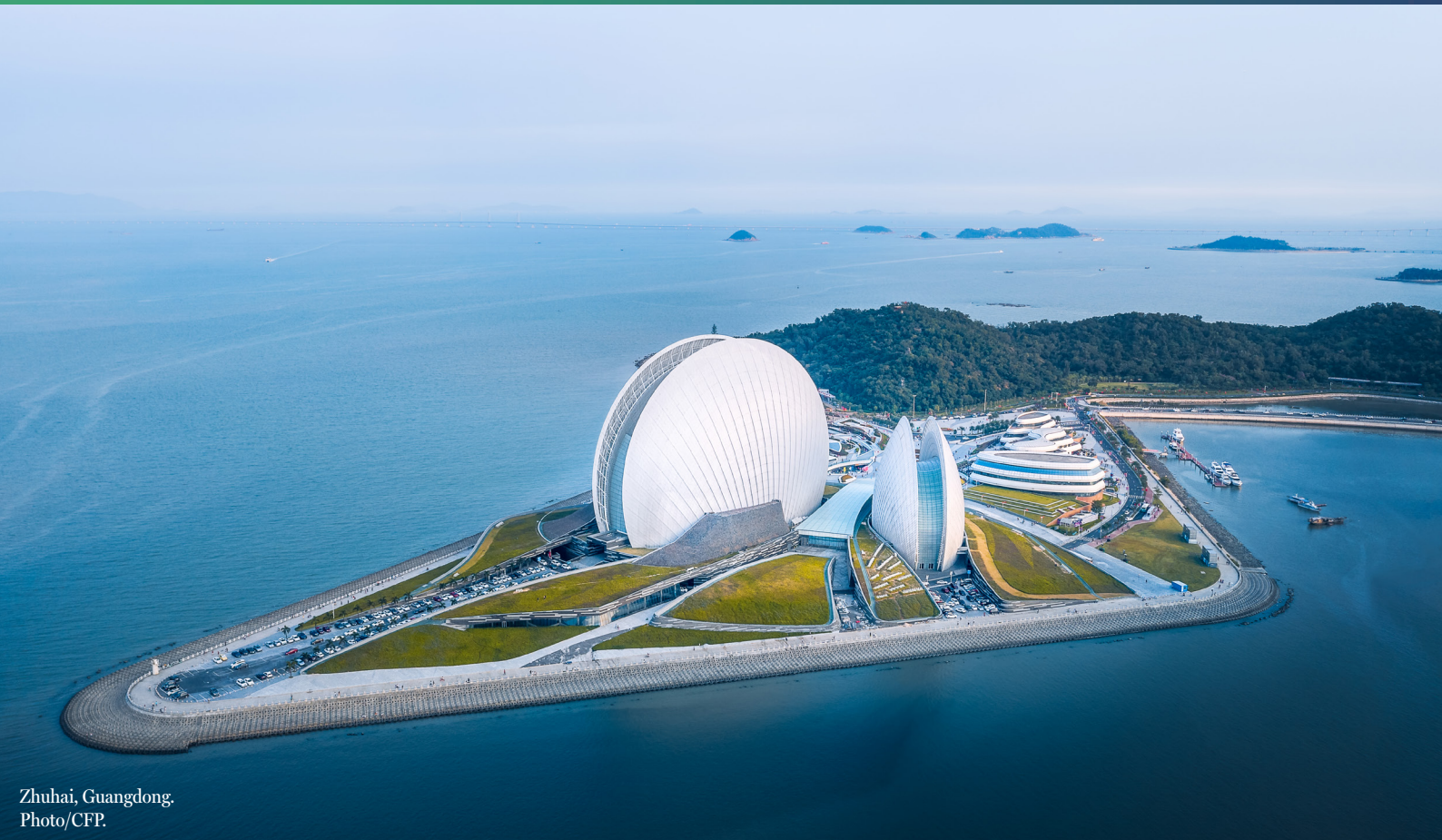
Zhuhai, Guangdong.

The official newsletter of the Belt and Road Languages and Cultures network