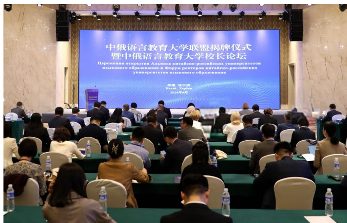
Attendees at work during the forum.

The Alliance of Chinese-Russian Language Education Universities and China-Russia Language Education University Presidents Forum in Harbin on May 18 brought together more than 100 leaders, experts, and scholars from 25 Chinese universities and 12 Russian universities. The alliance aims to foster deeper collaboration between Chinese and Russian universities in language teaching and promotion and other related fields, and to cultivate talent aligned with the needs of today's society, thereby contributing to the long-term development of friendly relations between the two countries.