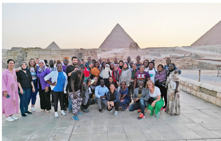
A visit to the pyramids during the event.

The Africa English Language Teachers Association (ELTA) had its 8th annual international conference from the 30th of May to the 1st of June 2024. The conference was in Cairo, Egypt under the theme, "TRANSFORMING MINDS, TRANSFORMING LIVES IN ELT." More than 600 people from more than 25 African countries and more than 10 countries outside the continent were in attendance. There were 128 presenters of research-oriented sessions, workshops, presentations, and storytelling sessions.