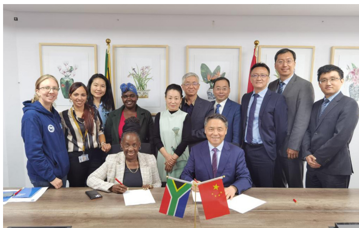
Representatives of Beijing Jiaotong University and the University of the Western Cape sign their agreement.