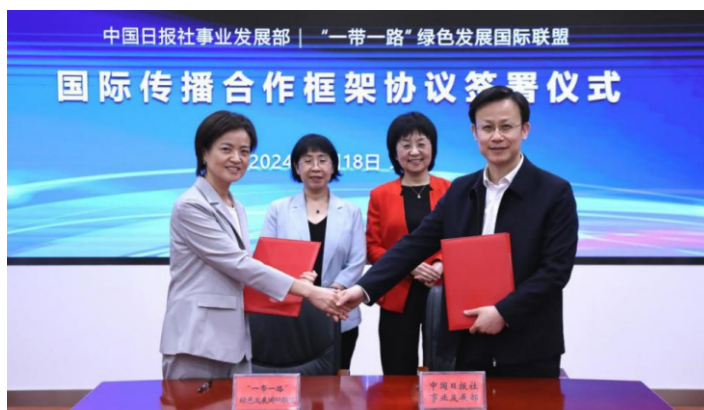
The signing ceremony of the collaboration framework agreement between China Daily and the BRI Green Development Coalition.

The Department of International Cooperation of China's Ministry of Ecology and Environment said a framework agreement between China Daily and the BRI Green Development Coalition signed in Beijing was a new chapter in their collaboration to strengthen communication capabilities in environmental issues. It would showcase China's role in global environmental governance and highlight the positive contributions of the Belt and Road Initiative to the United Nations 2030 Agenda for Sustainable Development, as well as its role in promoting international collaboration in green and low-carbon development, the department said.