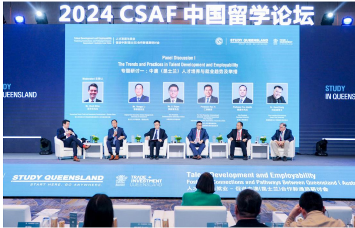
At 2024 CSAF