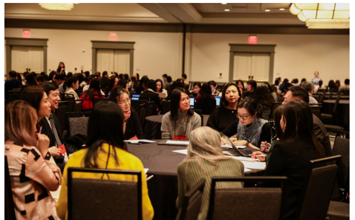
A CLTA roundtable discussion.

The Chinese Language Teachers Association, USA (CLTA) held its annual conference in St. Louis, Missouri, from April 5 to 7. The three-day event brought together more than 400 Chinese language teachers from across the globe and provided a platform for them to discuss research findings and teaching insights.