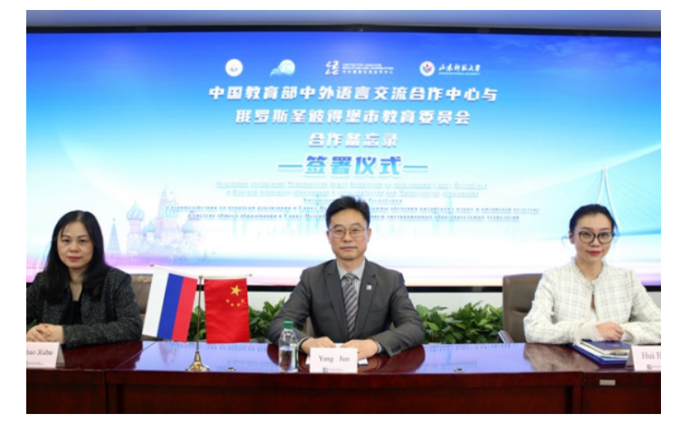
The online signing ceremony of the agreement between the Center for Language Education and Cooperation of the Ministry of Education of China and the Committee on Education of St Petersburg.

The Center for Language Education and Cooperation of the Ministry of Education of China and the Committee on Education of St Petersburg, Russia, signed a cooperation memorandum to apply distance education technology to the education system of St Petersburg to teach Chinese and Chinese culture on Jan 31. The program will be implemented by the International Education College of Shandong Normal University in Jinan and the Confucius Institute of St Petersburg.