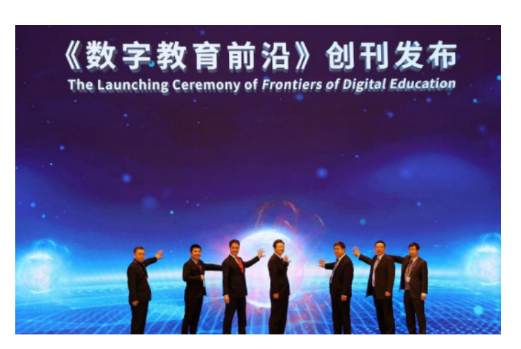
The latest edition of Frontiers of Digital Education was published in Shanghai.

The latest edition of the seasonal journal Frontiers of Digital Education was unveiled at the World Digital Education Conference in Shanghai on Jan 31. The journal is published by Higher Education Press under the auspices of the Chinese Ministry of Education. Overseas distribution is managed by Springer Nature of Germany. It is a quarterly Englishlanguage publication with advisory and editorial board members in China, Germany, the United States and elsewhere. The journal focuses on interdisciplinary research in the fields of digital technology and education, aiming to inform readers about policy trends in digital education, analyze crucial problems and help deal with pressing challenges in digital education and technology innovation.