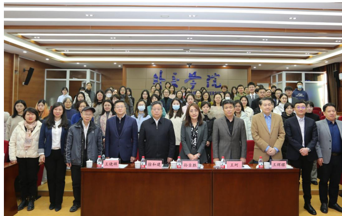
Attendees of the forum

The High-level Forum on Foreign Language Translation and International Communication hosted by China Foreign Affairs University in Beijing concluded on Dec 29. Experts and scholars in foreign affairs, translation studies and international communication engaged in discussions and exchanges on topics related to translation and international communication.