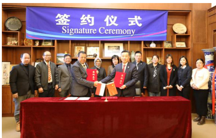
The presidents of the two universities after signing an academic and cultural cooperation agreement.