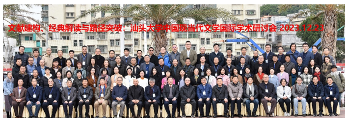
Attendees of the forum.

The Literary Construction, Classic Interpretation, and Path Breakthrough: International Academic Conference on Chinese Modern and Contemporary Literature was held at Shantou University in Guangdong province from Dec 23 to 24. Scholars from more than 80 universities and research institutions took part. They included representatives of: the University of Alberta in Canada; Nanyang Technological University in Singapore; The University of Malaya and Sultan Idris Education University in Malaysia; and Setsunan University in Japan.