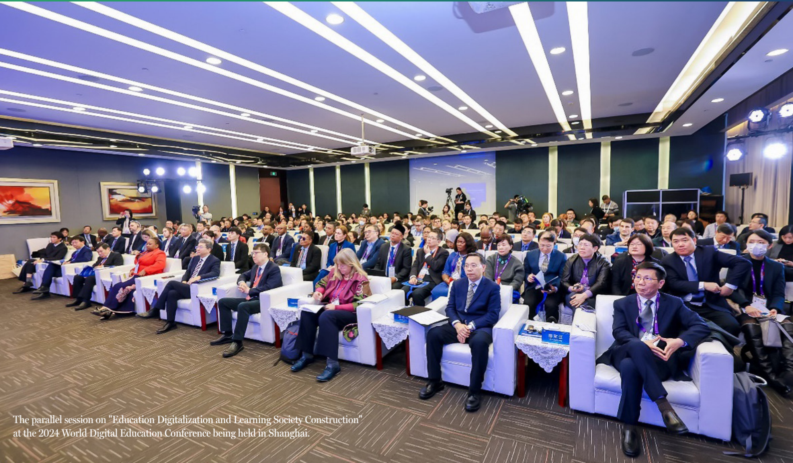
The parallel session on "Education Digitalization and Learning Society Construction" at the 2024 World Digital Education Conference being held in Shanghai.

The official newsletter of the Belt and Road Languages and Cultures network