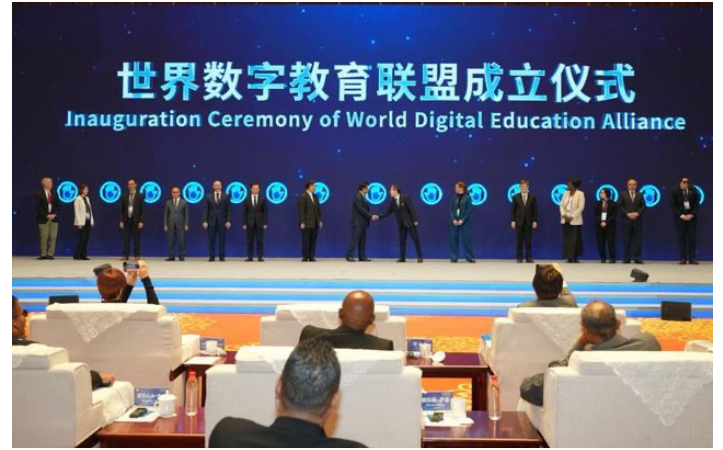
The President of the General Conference of UNESCO Simone-Mirella Miculescu addressed the conference.