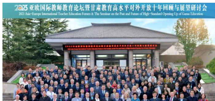
The forum opening ceremony.

The Asia-Europe International Teacher Education Forum and the Seminar on the Past and Future of High-Standard Opening Up of Gansu Education was held at Northwest Normal University in Lanzhou, Gansu province, on Dec 11. Attendees delivered keynote speeches under the theme "Asia-Europe International Teacher Education", looking at high-standard opening up of the province's education. They also discussed topics including international talent cultivation in Asia and Europe, promoting teacher professional development through collaboration among universities in Asia and Europe. They also looked at the direction of contemporary teacher education reform and the internationalization of education.