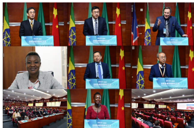
The opening ceremony and keynote speakers at the China-Africa Deans of Education Forum.

The China-Africa Deans of Education Forum was held at Beijing Normal University on Nov 15. Deans of education of 10 universities in 10 African countries including Gambia, Nigeria, Rwanda, Tanzania and Zambia, UNESCO representatives and deans of education of 13 Chinese universities attended. They delivered speeches with the theme “Education revolution for a more resilient future” and discussed how to strengthen collaboration and communication between China and Africa in education.