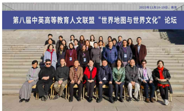
Experts and guests at the China-UK Humanities Alliance for Higher Education Forum.