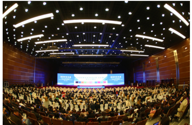
The plenary session of the World Chinese Language Conference.

The World Chinese Language Conference was held at the China National Convention Center in Beijing on Dec 8. More than 2,000 people attended, including national ministers of education, representatives of international organizations and language and culture institutions, leaders of local education authorities in China, presidents of universities in China and elsewhere, directors of Confucius Institutes, and those engaged in and concerned with international Chinese education.