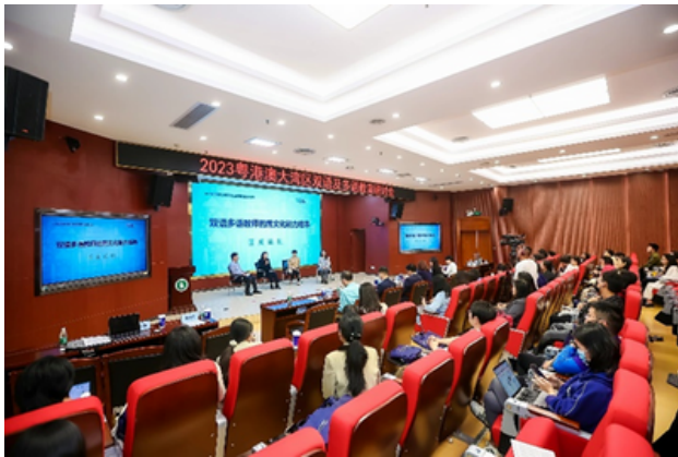
The panel session of the seminar.

The Seminar of Bilingual and Multilingual Education in Guangdong-Hong Kong- Macao Greater Bay Area was held in Guangzhou, Guangdong province on Nov 25. Its topic was “Orientation and development of bilingual and multilingual education for the Greater Bay Area in the context of globalization”. The aim was to promote the development of China’s bilingual and multilingual education, giving full play to the advantages of the Greater Bay Area’s location and educational resources, and cultivating high-quality bilingual and multilingual talent. The seminar was hosted by the committee of bilingual and multilingual education, Global English Education China Assembly.