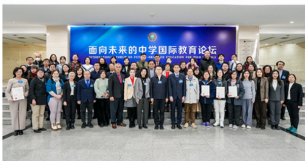
Attendees of the International Forum on Future-Oriented Education for High Schools.

The International Forum on Future-Oriented Education for High Schools was held at the Beijing Institute of Technology on Dec 19. The theme was “International and open future education”. More than 60 people attended, including experts in basic education from China and Southeastern Asian countries and presidents.