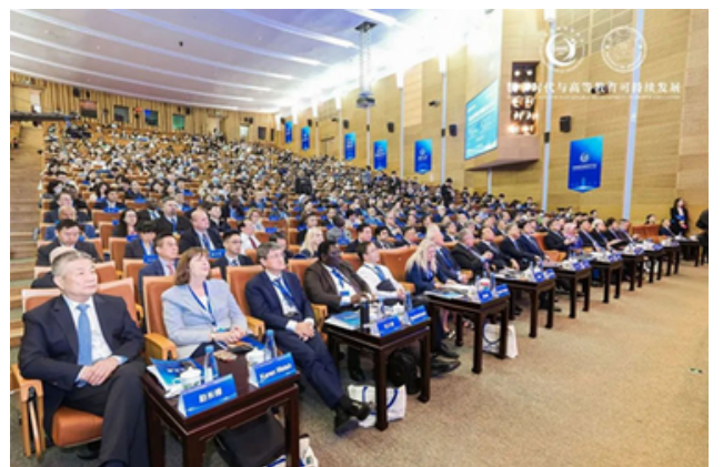
The plenary session of the 2023 Annual International Forum on Higher Education.

The 2023 Annual International Forum on Higher Education, hosted by China Association of Higher Education and Xiamen University, Fujian province, was held in Xiamen on Dec 10. More than 800 people from nearly 30 countries attended, including national ministers of education and scientific research, representatives of international organizations, embassies or consulates in China, university presidents and experts and scholars attended and discussed the theme “the Digital Age and Sustainable Development in Higher Education”.