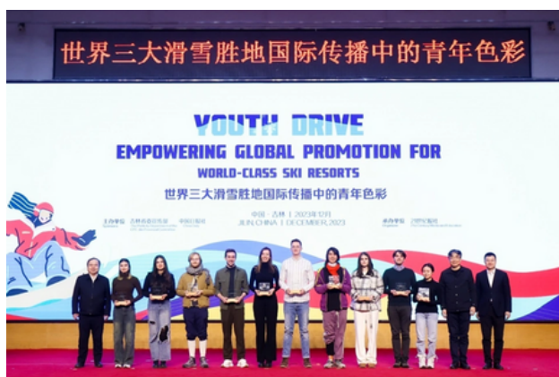
The host and guests presented the commemorative plate of Jilin Cultural Communication Officer to representatives of Generation Z from eight countries.

An exchange event featuring “youth drive empowering global promotion for world-class ski resorts” was held at Jilin University, Changchun province on Dec 20. The aim was to promote communication between young people of China and other countries through expert lectures, tours for participants to experience ice and snow culture, and through exchange events and seminars. More than 10 outstanding youth representatives of Generation Z in China and elsewhere as well as more than 200 student and teacher representatives of Jilin University attended. The event was co-sponsored by the Publicity Department of the Communist Party of China Jilin Provincial Committee and China Daily and was organized by 21st Century. Jilin University provided great support.