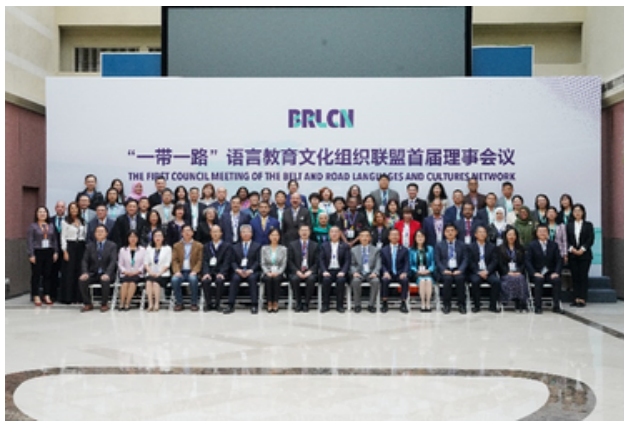
Group photo of the first council meeting of the BRLCN.

Language educators representing more than 50 countries involved in the Belt and Road Initiative have established the Belt and Road Languages and Cultures Network. This momentous collaboration, formalized in Beijing on Oct 16, seeks to break down language barriers and cultural misunderstandings on a global scale. The council now consists of five dozen members from Asia, Africa, Europe and South America.