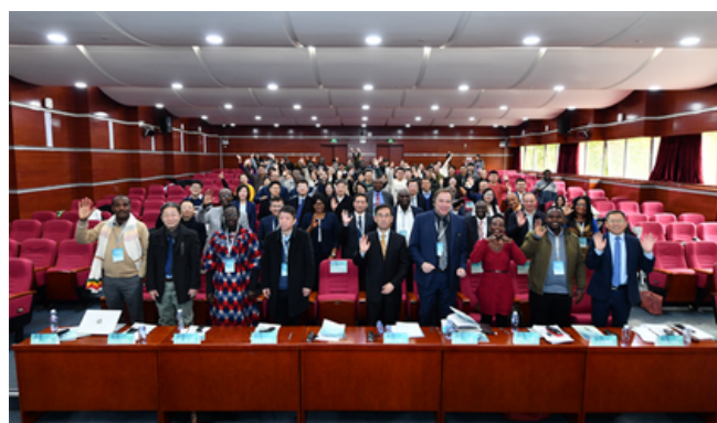
Experts and representatives at the forum.

The China-Africa Deans of Education Forum was held at Beijing Normal University on Nov 15. Deans of education of 10 universities in 10 African countries including Gambia, Nigeria, Rwanda, Tanzania and Zambia, UNESCO representatives and deans of education of 13 Chinese universities attended. They delivered speeches with the theme “Education revolution for a more resilient future” and discussed how to strengthen collaboration and communication between China and Africa in education.