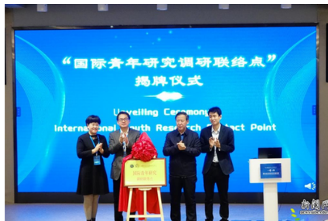
Unveiling ceremony of the International Youth Research Contact Point.

The seventh meeting of the International Youth Dialogue was held at the University of International Business and Economics in Beijing recently. The theme was "Belt and Road Youth Cultural Inheritance and Mutual learning of Civilizations". Experts and scholars from China, Egypt, Germany, Pakistan and Saudi Arabia as well as youth representatives from many industries attended. A research report on Belt and Road youth dialogue was issued at the event.