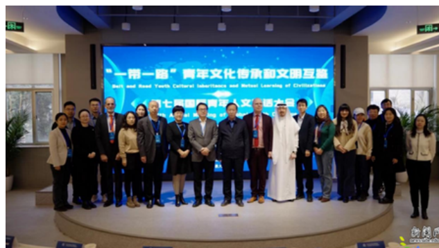
Scholars, experts and representatives at the seventh meeting of the International Youth Dialogue in Beijing.

The seventh meeting of the International Youth Dialogue was held at the University of International Business and Economics in Beijing recently. The theme was "Belt and Road Youth Cultural Inheritance and Mutual learning of Civilizations". Experts and scholars from China, Egypt, Germany, Pakistan and Saudi Arabia as well as youth representatives from many industries attended. A research report on Belt and Road youth dialogue was issued at the event.